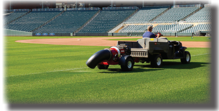
SPORTS FIELDS & GROUNDS